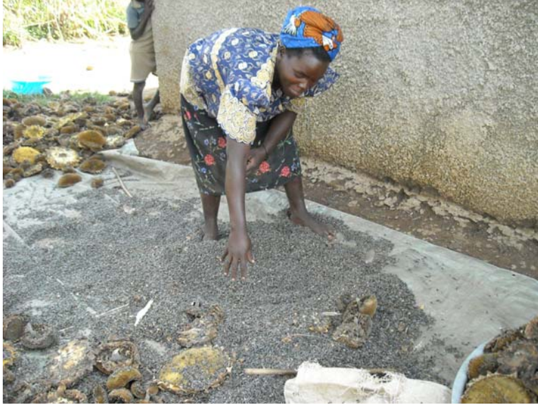
She is spreading the seeds to dry in the sun.

Some seeds are eaten because they are yummy and good for people to eat. The seeds are full of vitamins and minerals. Eating them and cooking with the oil keeps everyone in Opac healthy.