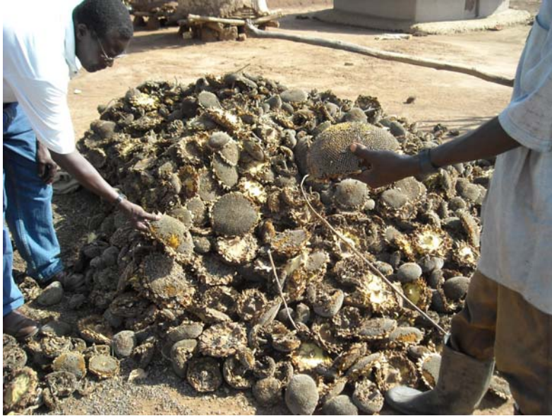
The man with the stick is knocking the seeds from the flowers.

The harvest comes in June. The drying sunflower blossoms are cut off the stalks and dried some more in the warm sun for three days. Then an adult takes a stick and hits the blossom until all the seeds come out. There are about 800 seeds in each sunflower.