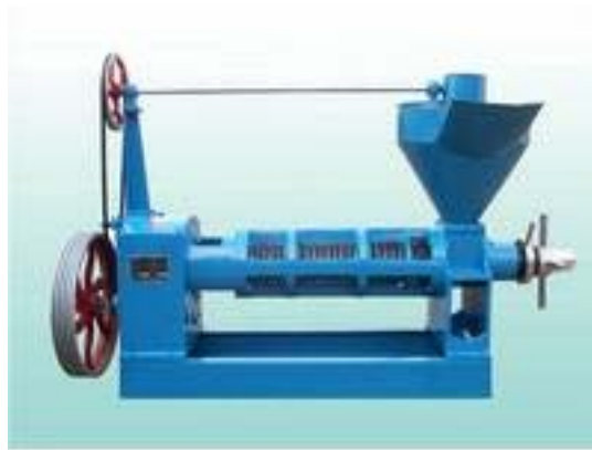
An oil press used at a factory.

The mothers in Opac use the money they get from selling their seeds to buy food, clothing, medicine, and school books for their families.