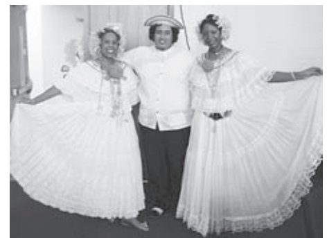
Grufolpawa, a Panamanian folklore dance group from Washington, D.C., performed at St. James' International Sunday.

Families with young children had the option to play games inside a classroom designated just for them. Children whacked a piñata, played with balloons and completed word searches of African and Caribbean countries. A Journeys Unlimited travel consultant was on hand to promote the St. James' Holy Land